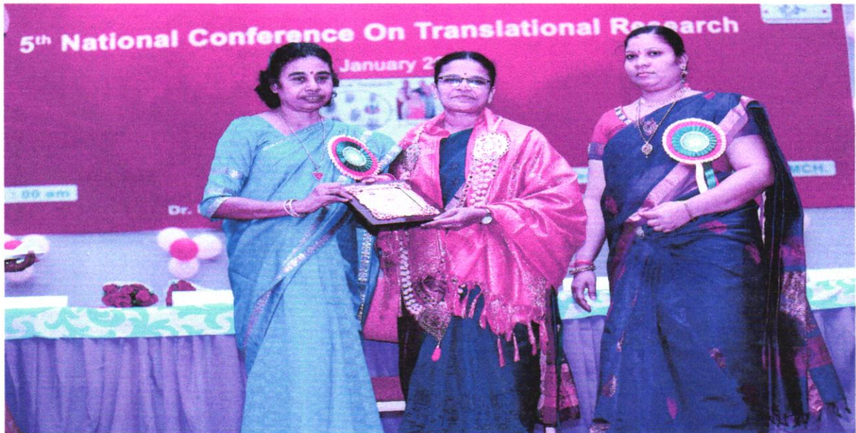
FIG-2- FELICITATION OF GUEST OF HONORS AFTER END OF SESSION

e-mail : narayana_nursing@yahoo.co.in website : www.narayanannursingcollege.com